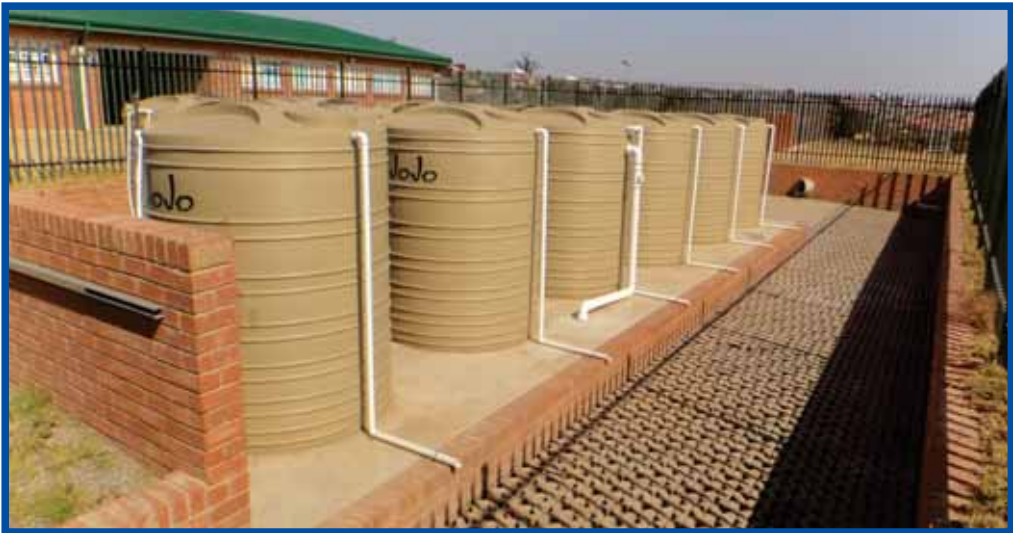
UbuGcisa buGcino kwiZikolo