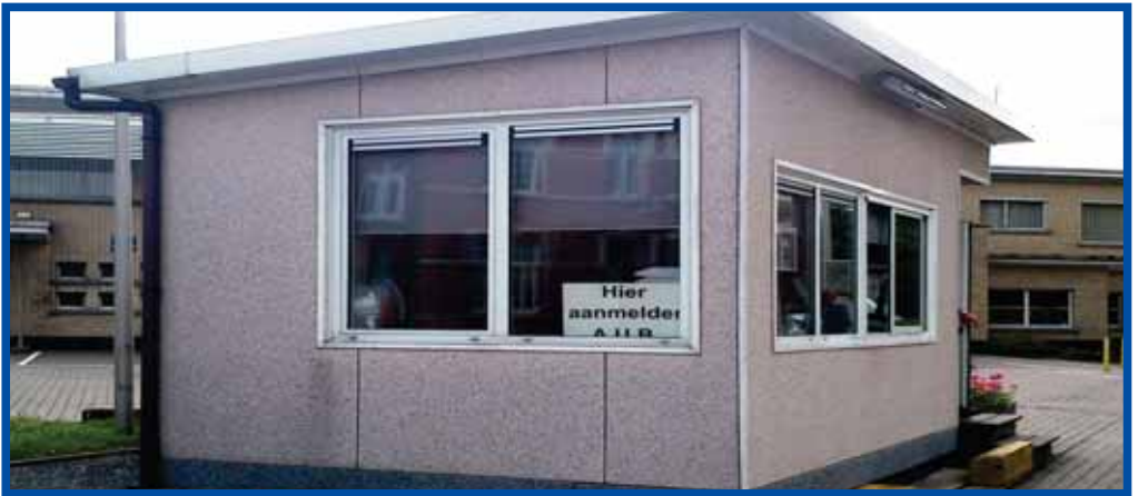
I-Guardhouse kunye neNgenelo kwiziko lempilo