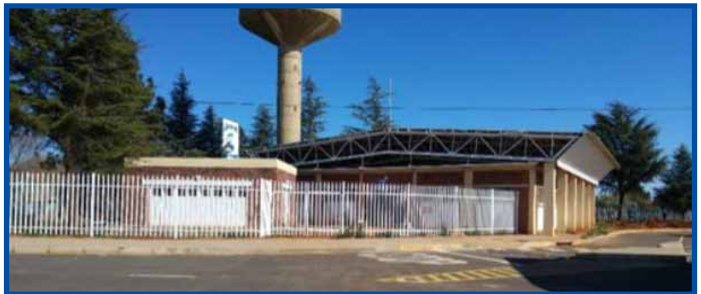
Ukuvuna kwamanzi emvula ezikolweni