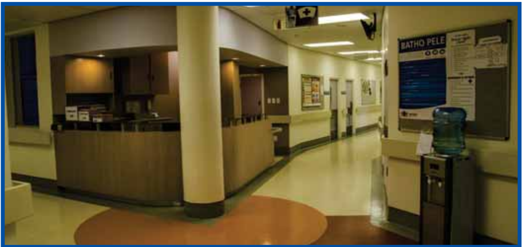
Reception Area at Health Facility