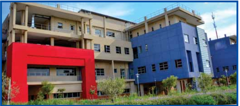
Isibhedlele saseBheki Mlangeni