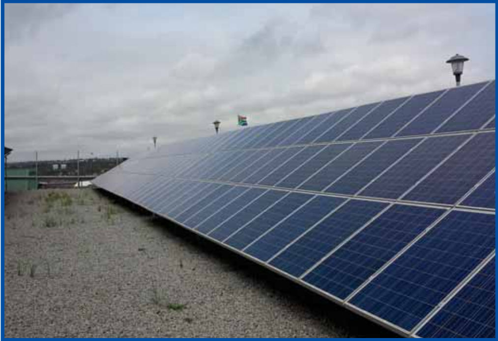
I-Ofisi ye-Rooftop Solar Photovoltaic Ofisi yeNtloko ye-GRID kwi-Corner House eGoli

IziKlomelo zeZakhiwo zoBuGreen zaseGauteng zezikolo zaseGauteng zenziwe ngokubambisana ne-CSIR, i-GBCSA, ii-Architects ezivela kwiinkonzo zobungcali, abaphathi beprojekthi, isondlo kunye ne-GDE. Izikolo eziyi-16 zonyaka wezimali ka-2015/6.